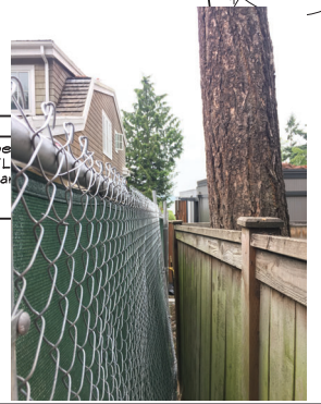
LANDSCAPING Refer to Landscape Schedule & Notes (L), planters, pathways, and details.