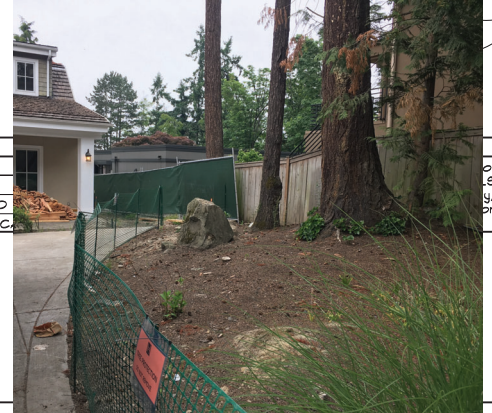
Removal (total of 15-21), Planting, Protection & Care details.